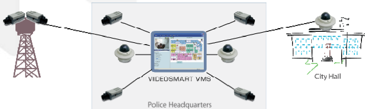
Representation of Exeter Police Department Surveillance System

Exeter Police Department uses its video surveillance system to manage video security at the police headquarters along with the city hall and a nearby water tower. ACTi provides MPEG-4 IP cameras (CAM-5120, CAM-5200, and CAM-7100) while Ortega provides the VideoSmart VMS to provide centralized management on a web-based intuitive interface.